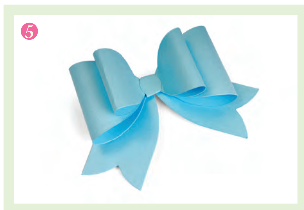
5. Both small and large Bows are combined to create the finished French Bow. In this example, the knot piece has only been wrapped around the Bows, allowing the ribbon piece to be arranged independently.