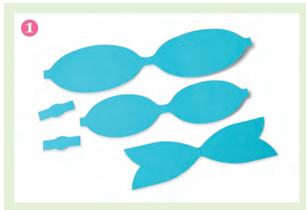
1. Die-cut from desired material