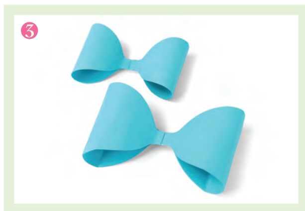
3. Create a soft bend on the bow by running it against the hard edge of a counter or a ruler. This is similar to curling ribbon with a pair of scissors. Adhere the end tabs to the center of the bow using quick-dry glue, and secure in place with paper clips.