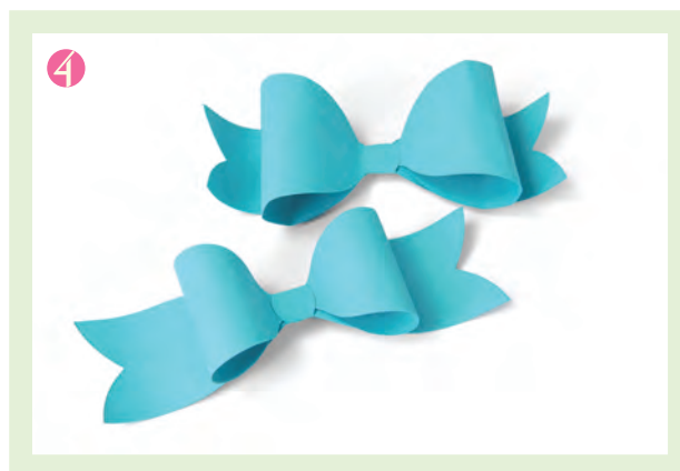
4. Simple Bows can be created by using the small and large Bow pieces individually and are made by adhering the Bow pieces on top of the ribbon piece and finishing by wrapping the knot piece around the center.